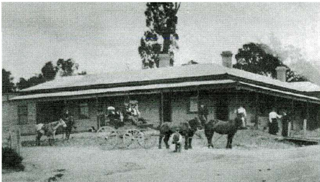
The Terminus Hotel in the 1890's